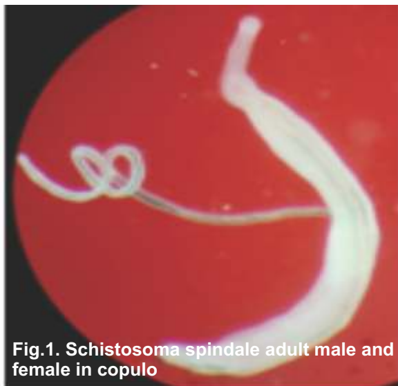
Fig.1. Schistosoma spindale adult male and female in copulo

The sexes of schistosome flukes are separate. Generally the female flukes are long and slender. The male is broad and flat with the sides of the body curved inwards to form a gutter like groove known as gynecophoric canal in which the female is present in copulo. The size of the adult worms varies depending on the species of schistosomes. Male S. spindale measures 5.6 - 13.5 mm and female worm measures 7.2 - 16 mm (Fig.1)