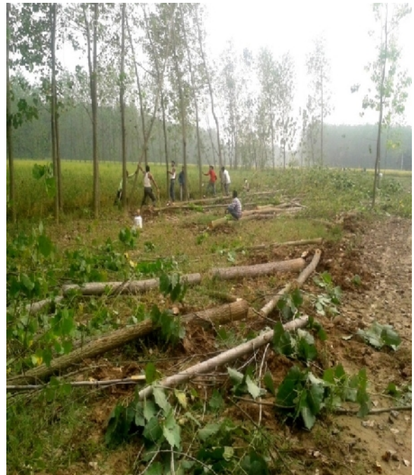
Plate 1: Harvesting operation of poplar wood in Yamunanagar, Haryana