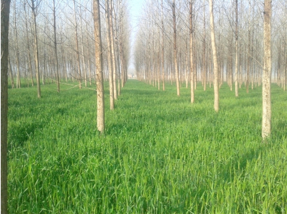
Plate 3: Poplar + Wheat based agroforestry system in Yamunanagar