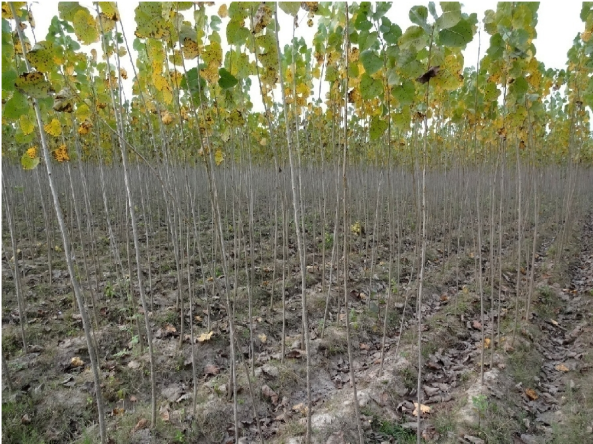
Plate 6: One year old Entire Transplants (ETPs) of Poplar under nursery condition