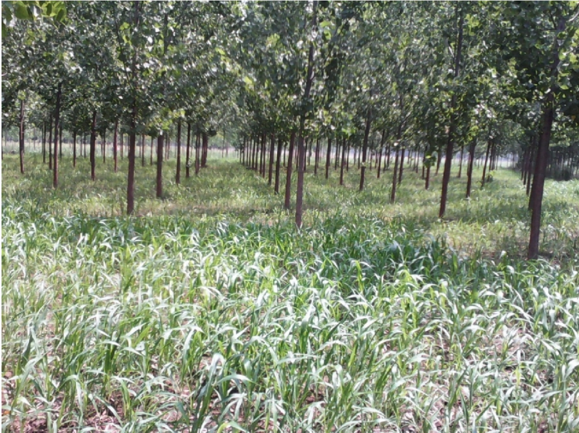
Plate 4: Poplar + Sorghum based agroforestry system in Yamunanagar during Kharif season