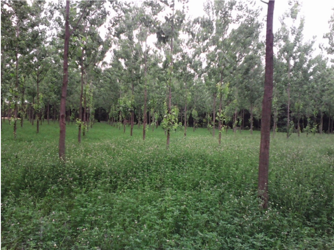
Plate 5: Poplar + Barseem based agroforestry system in Yamunanagar during Rabi season