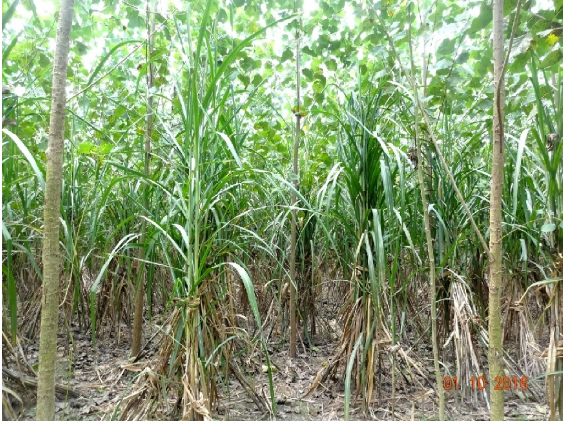
Plate 2: Poplar + Sugarcane based agroforestry system in Yamunanagar