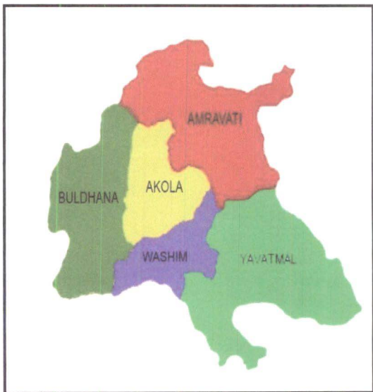
Fig.1. Map of Amravati Division