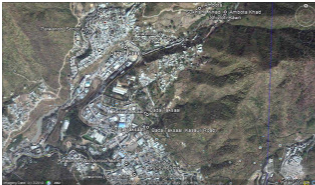
Plate 2 Sampling locations in Parwanoo area