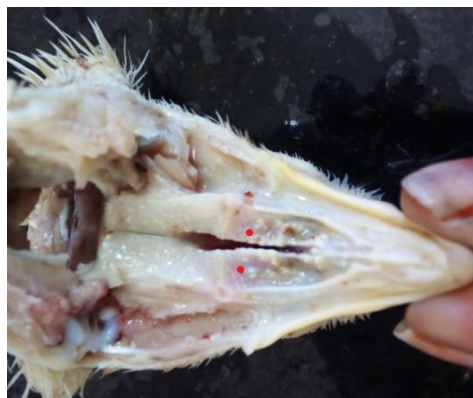
Figure 1: Photograph showing the upper jaw of chicken showing the light red colour area (Red spot) at the mouth and the pharyngeal cavity demarcation

The mouth and pharynx of turkey, chicken and Japanese quail lack a definite line of demarcation and so it constituted a common oropharyngeal cavity. However, McLelland (1993) stated that the boundary between the mouth and pharynx in the duck was at the level of the caudal lingual papillae based on embryological study. In chickens, the mouth and pharyngeal cavity was well demarcated but not seen in Turkey and Japanese quail (Fig. 1).