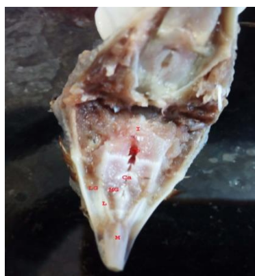
Figure 5: Photograph showing the roof of the oropharyngeal cavity of Japanese quail. M – Median palatine ridge, L – Lateral palatine ridge, LG – Lateral groove, MG – Median groove, Ca – anterior part of choanal slit, CP – Posterior part of choanal slit and I – Infundibular slit.