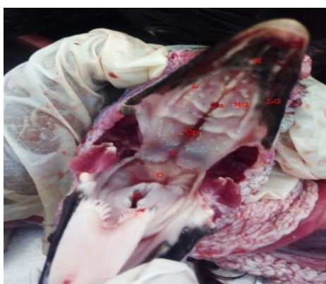
Figure 3: Photograph showing the roof of the oropharyngeal cavity of Turkey. M – Median palatine ridge, L – Lateral palatine ridge, LG – Lateral groove, MG – Median groove, Ca – anterior part of choanal slit, CP – Posterior part of choanal slit, I – Infundibular slit, O – Oesophagus and G – Glottis.