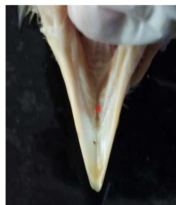
Figure 6: Photograph showing the floor of the oropharyngeal cavity of chicken showing median groove (M)