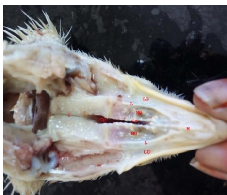
Figure 4: Photograph showing the roof of the oropharyngeal cavity of chicken. M – Median palatine ridge, L – Lateral palatine ridge, LG – Lateral groove, MG – Median groove, Ca – anterior part of choanal slit, CP – Posterior part of choanal slit and I – Infundibular slit.

In chicken it was a single continuous part without papilla (Fig. 4). In Japanese quail median ridge was consisted of only continuous cranial part and absence of caudal part (Fig. 5). Similar finding as turkey was found in ostrich (Tivane et al. , 2011). But dub shaped median ridge was found in pigeon (Igwebuike et al. , 2014). The present study showed that the length of the median palatine ridge was 3.5 cm, 1.1 cm and 0.3 cm behind the tip of the upper beak to the rostral end of the choanal slit in turkey, chicken and Japanese quail, respectively (Table 1). Similar results were observed in pigeon (Mohamed and Zayed, 2003) and ostrich (Tivane et al. , 2011). This median palatine ridge divided the anterior part into right and left sides. Similar observations were found in Muscovy duck (Igwebuike and Anagor, 2013) and Ostrich (Tivane et al. , 2011). In case of ducks, lateral borders of the hard palate had lamellae which was absent in the present study.