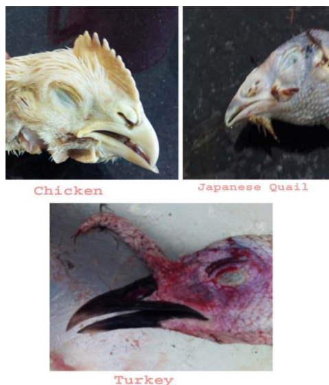
Figure 2: Photograph showing the shape of beak in chicken, Japanese quail and Turkey