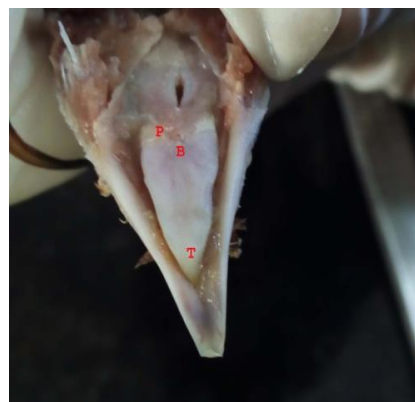
Figure 8: Photograph showing the tongue of Japanese quail. P – Root, B – Base and T – Tip of the tongue

The tongue of the Chicken, Japanese quail and Turkey were triangular shaped with different breadth and width (Fig. 7,8 & 9). It had root, body and tip. The tip of the tongue was found in the cranial part of the floor of the oropharyngeal cavity. In the present study, it was found within the floor of the oral cavity whereas in ducks, it extended to the full length of the floor of the oral cavity (Igwebuike and Anagor, 2013). The tip of tongue was pointed in all the birds studied but in contrary to this it was smooth, broad and shovel-shaped in ducks (Igwebuike and Anagor, 2013). The tongue body had a slight elevation which corresponded to the torus linguae in mammal but in ducks it was bell shaped and it had a prominent median sulcus on the dorsal surface of the organ and was absent in all the birds studied. Numerous long brush-like horny lingual papillae were situated at the lateral margins of the rostral half of the tongue body in duck (Igwebuike and Anagor, 2013). Caudal to the elevation, tongue possessed a row of caudally-pointed broad papillae, which was marked the caudal boundary of the tongue. In ducks, small lingual papillae at the cranial border of the bell-shaped elevation (Igwebuike and Anagor, 2013) were not found in the present work.