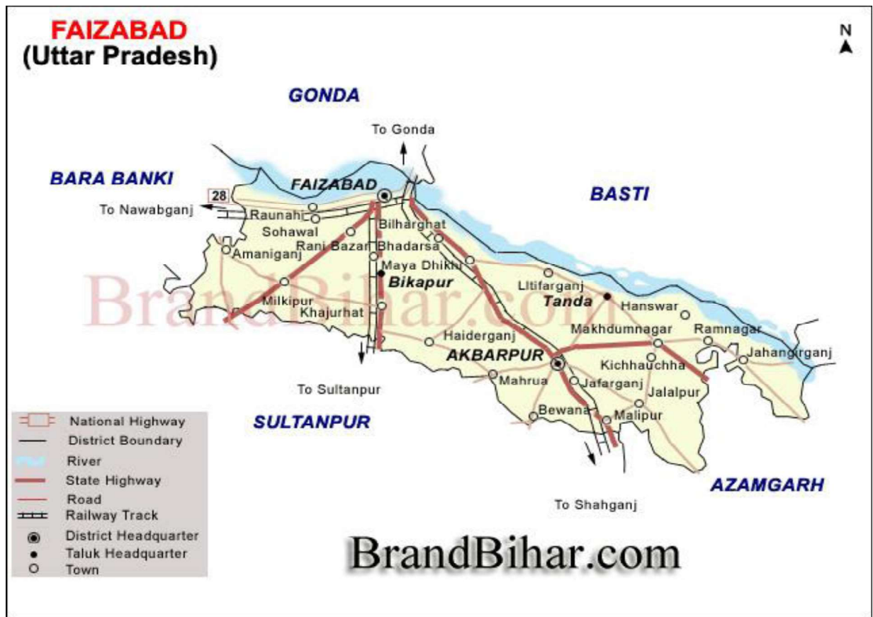
Fig. 1 Map of Ayodhya district of Uttar Pradesh