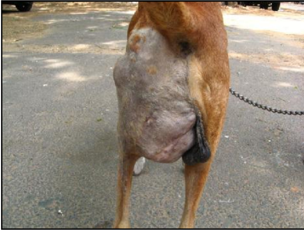
Fig 1. Dog-Nondescript – Thigh – Liposarcoma