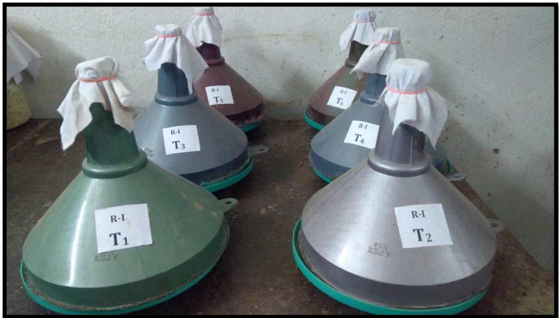
FIGURE 10. CLOSER VIEW OF THE EGG LAYING CAGES