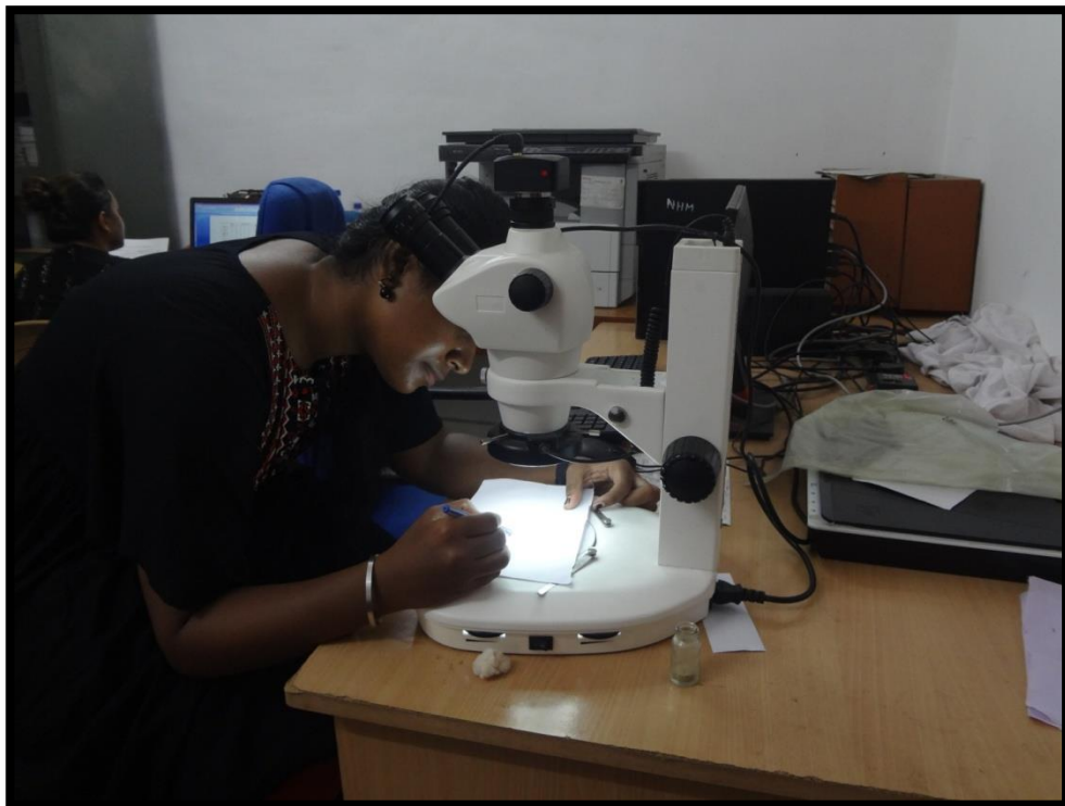
FIGURE 4. COUNTING OF RICE MOTH EGGS