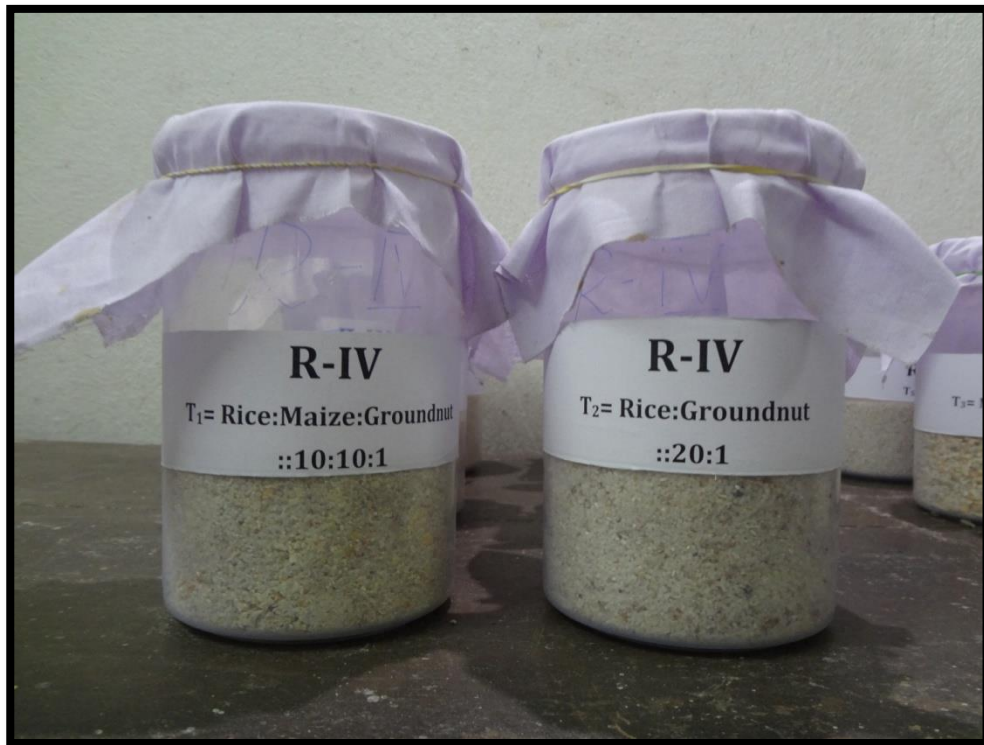
FIGURE 7. CLOSER VIEW OF TREATMENT JARS