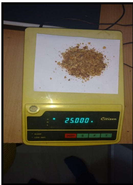
FIGURE 5. WEIGHING OF GROUNDNUT KERNEL