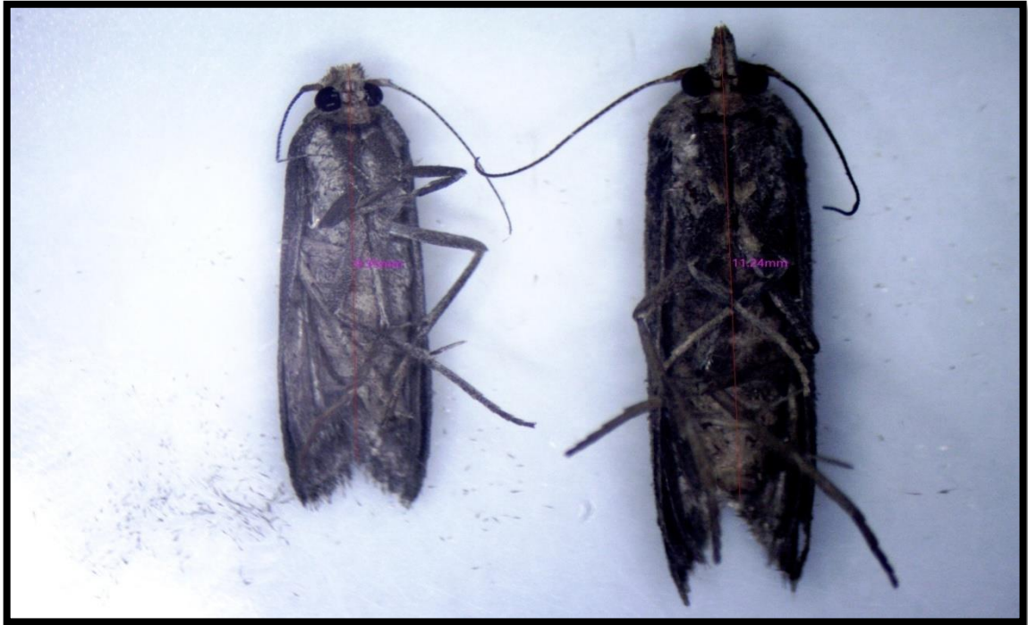
FIGURE 13. MORPHOMETRY OF ADULT MALE (LEFT) AND ADULT FEMALE (RIGHT) OF RICE MOTH