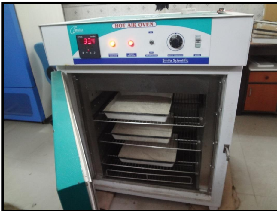
FIGURE 2. TREATMENT OF THE SUBSTRATE IN HOT AIR OVEN