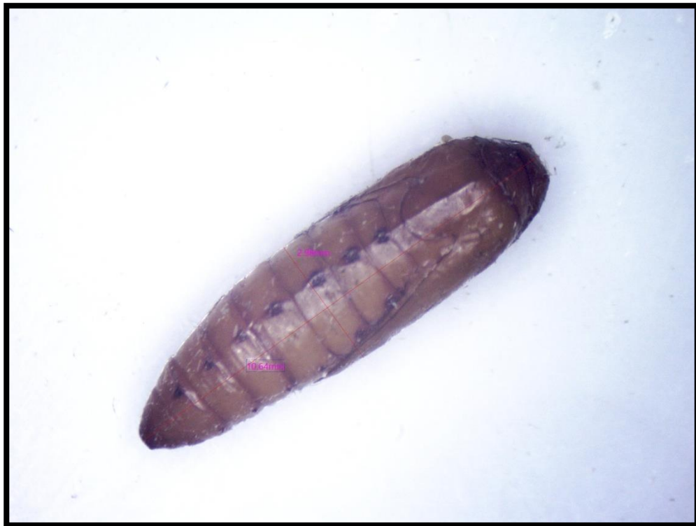
FIGURE 12. MORPHOMETRY OF PUPA OF RICE MOTH