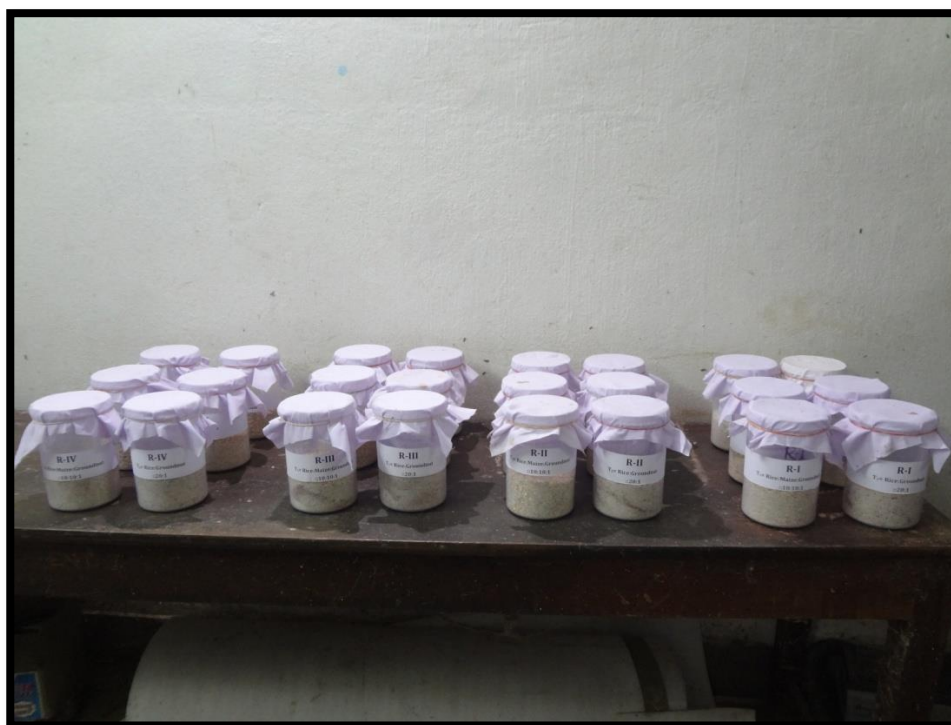
FIGURE 6. PREPARED TREATMENT JARS