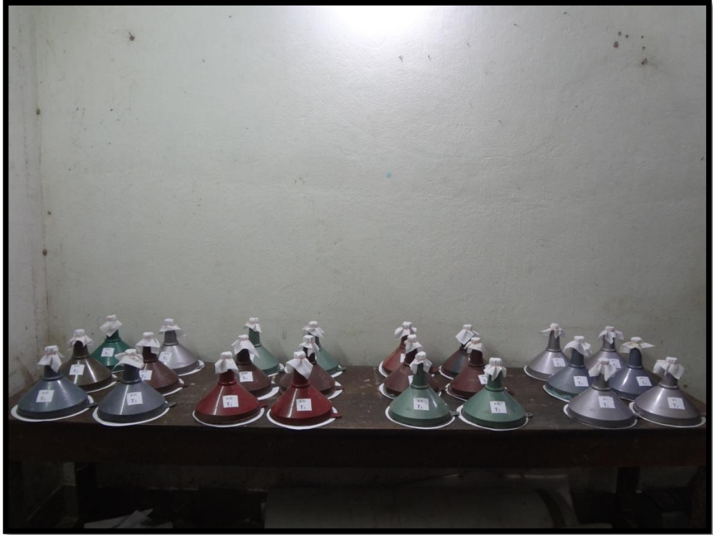
FIGURE 9. EGG LAYING CAGES