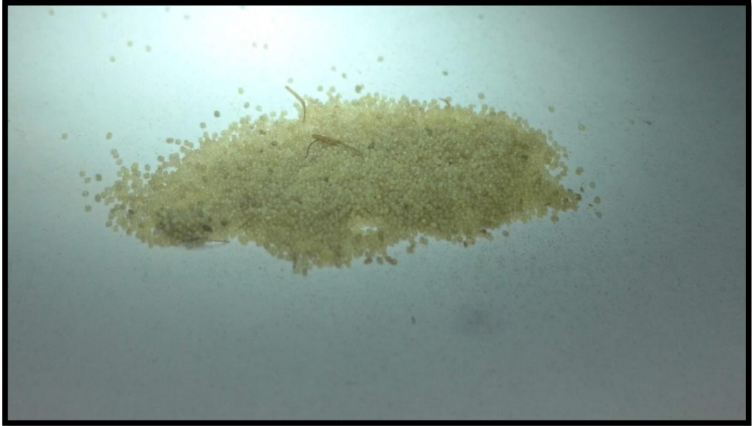
FIGURE 3. EGGS OF RICE MOTH