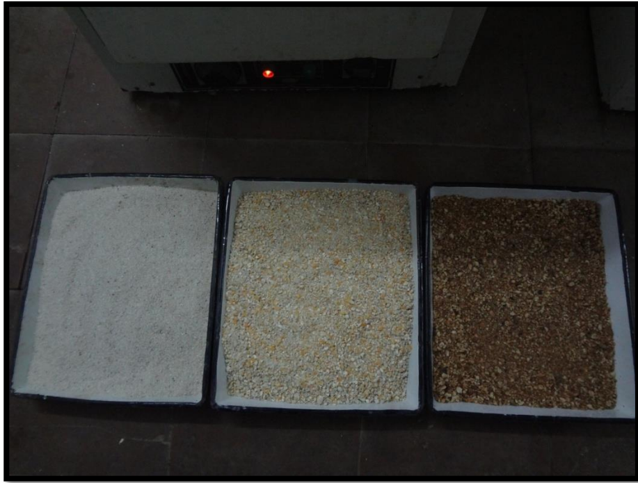
FIGURE 1. MILLED CEREAL GRAINS AND GROUNDNUT KERNELS