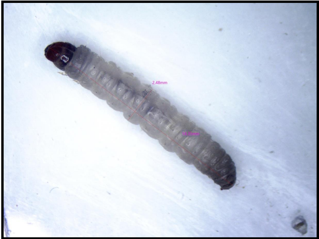
FIGURE 11. MORPHOMETRY OF LARVA OF RICE MOTH