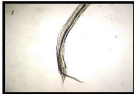
D. Heterakis gallinarum – tail end showing unequal spicules