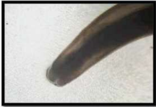
A. Ascaridia galli – head end showing three lips