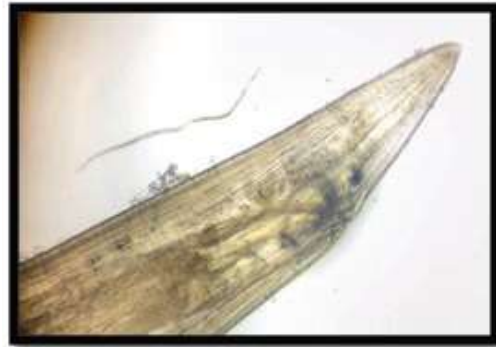
B. Ascaridia galli – tail end showing circular shaped precloacal sucker