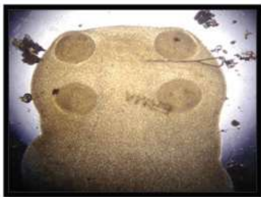
E. Raillietina echinobothrida scolex showing circular shaped suckers