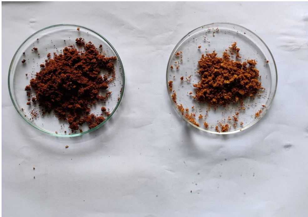
Plate 1: Dried apple fruit sample (Red Crab Apple and Ambri)