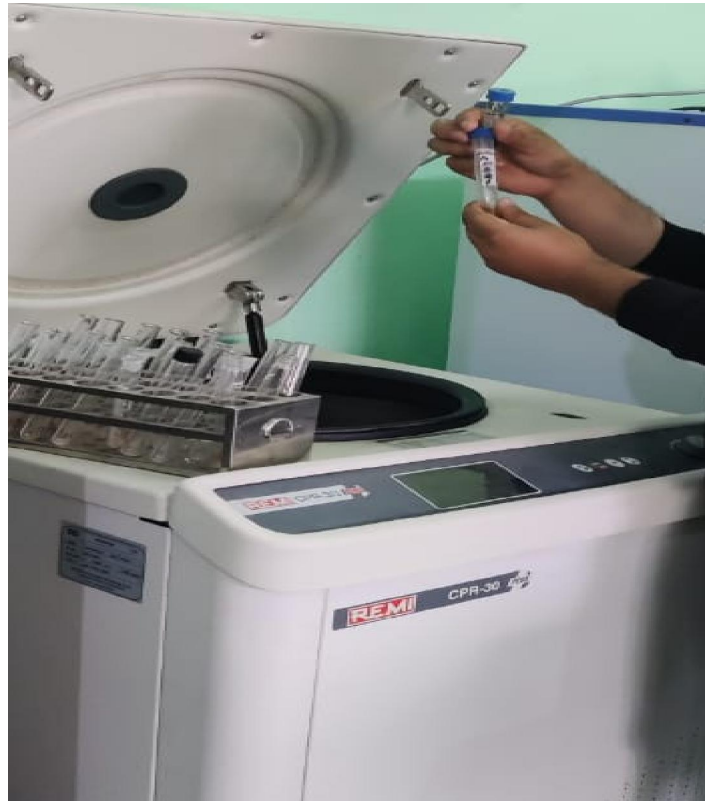
Plate 2: Lab work