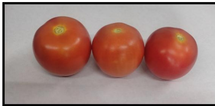
SKAU-T-1700 × SKAU-T -1424