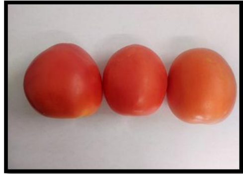
SKAU-T – 1429 × SKAU-T - 9862