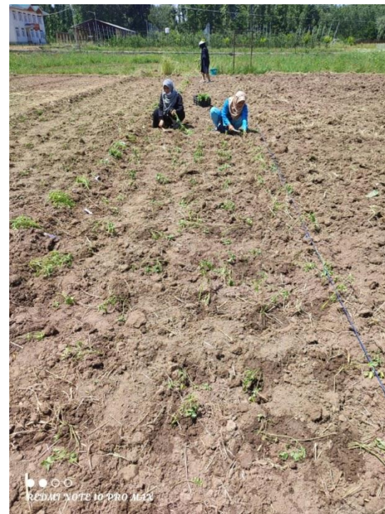
E 3 :Krishi Vigyan Kendra, Budgam