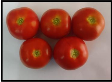
SKAU-T – 1429 × SKAU-T -1009