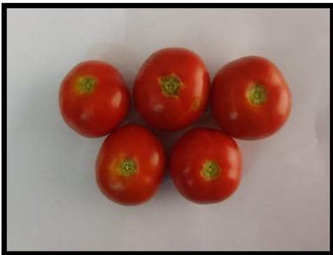
SKAU-T – 1219 × SKAU-T -1701