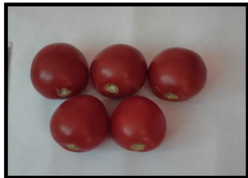
SKAU-T – 1700 × SKAU-T -1464