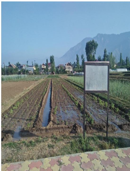
E 1 :Vegetable Experimental Field, Division of Vegetable Science, SKUAST- K, (Shalimar,Srinagar)