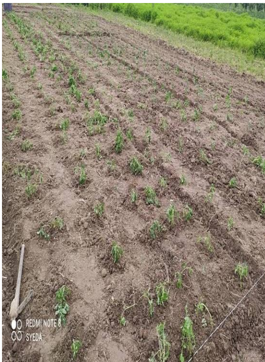
E 2 :Krishi Vigyan Kendra, Malangpora-Pulwama