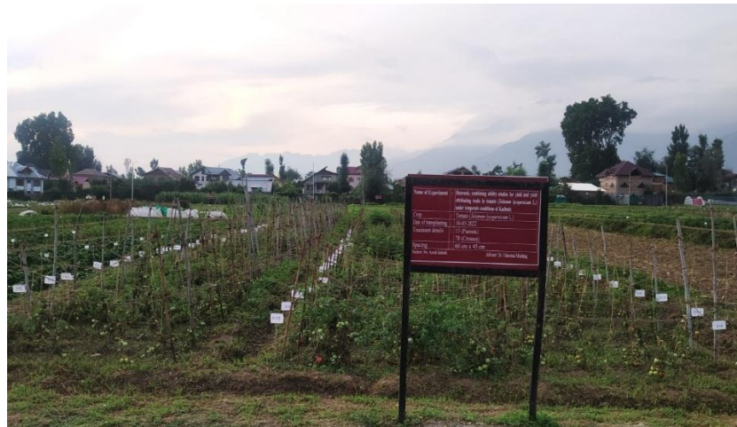
E 1 :Vegetable Experimental Field, Division of Vegetable Science, SKUAST-K, (Shalimar,Srinagar)