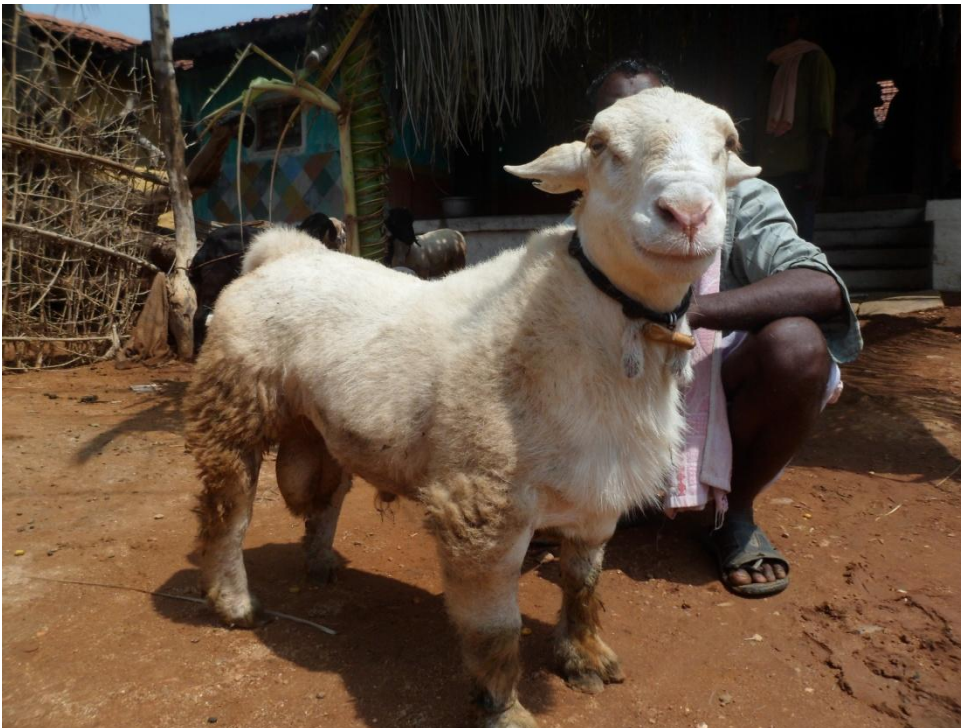
Fig . 5 Bandur Ram (4 teeth )