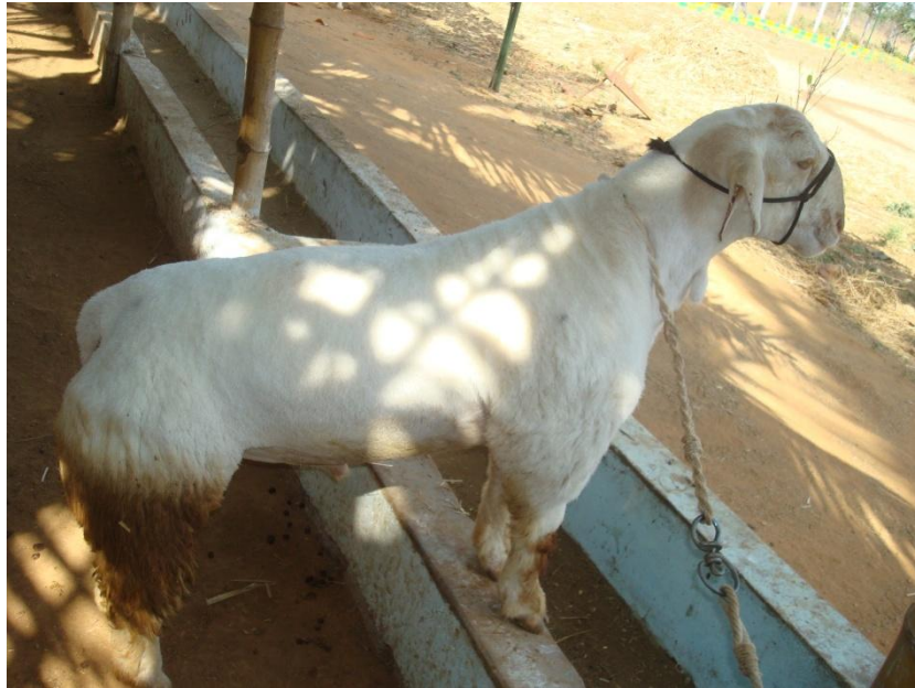
Fig . 8 Typical fore head and nose of Bandur sheep