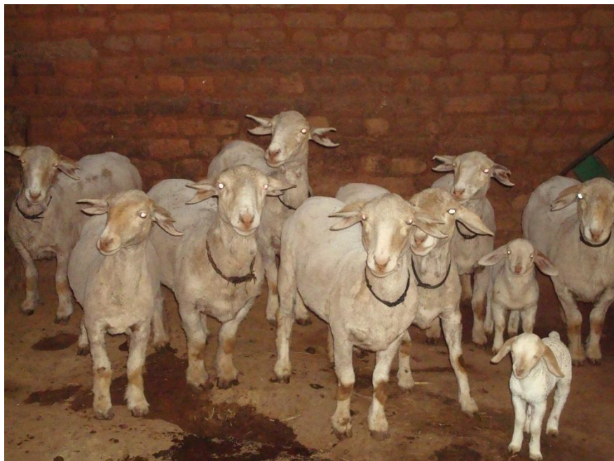
Fig . 11 Flock of Bandur sheep