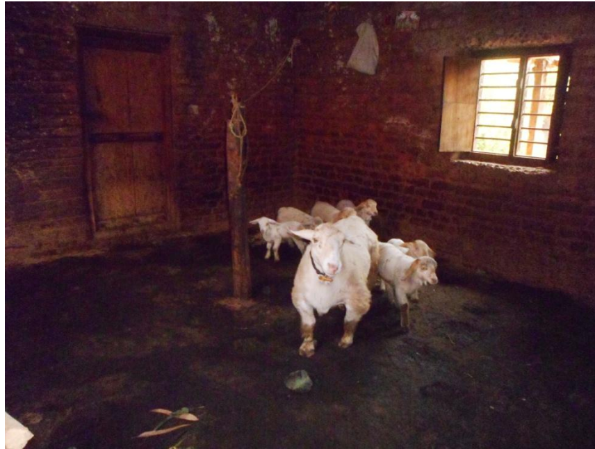
Fig . 10 Bandur ram with progenies (lambs)