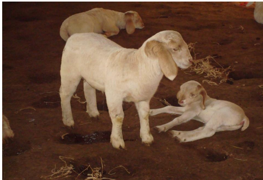
Fig . 3 three month old Bandur lamb