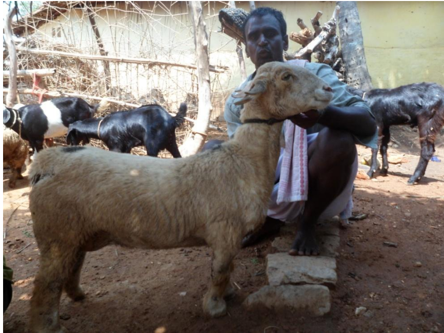
Fig . 6 Bandur ewe (4 teeth )