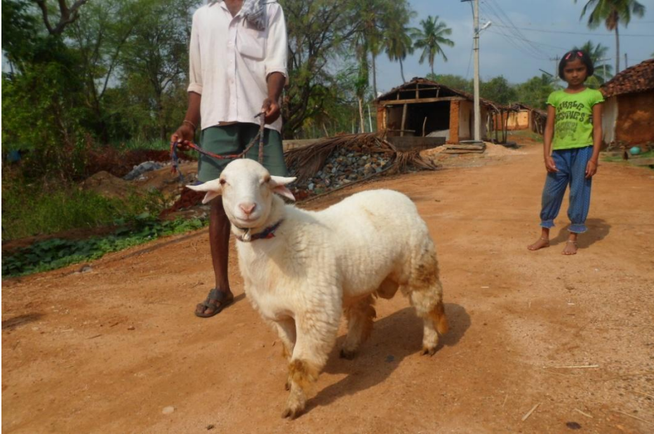
Fig . 4 Bandur Ram (2 teeth )