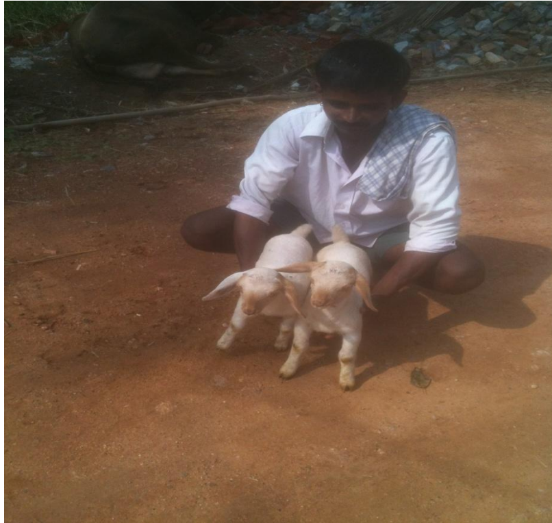
Fig . 2 Fifteen days old Bandur lambs