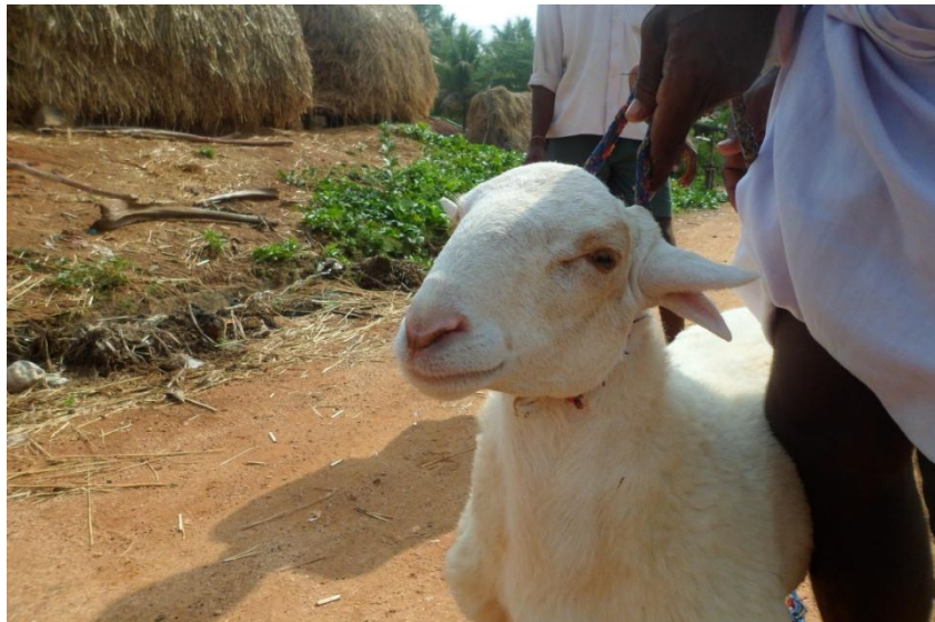
Fig . 9 Typical fore head and nose of Bandur sheep without wattles