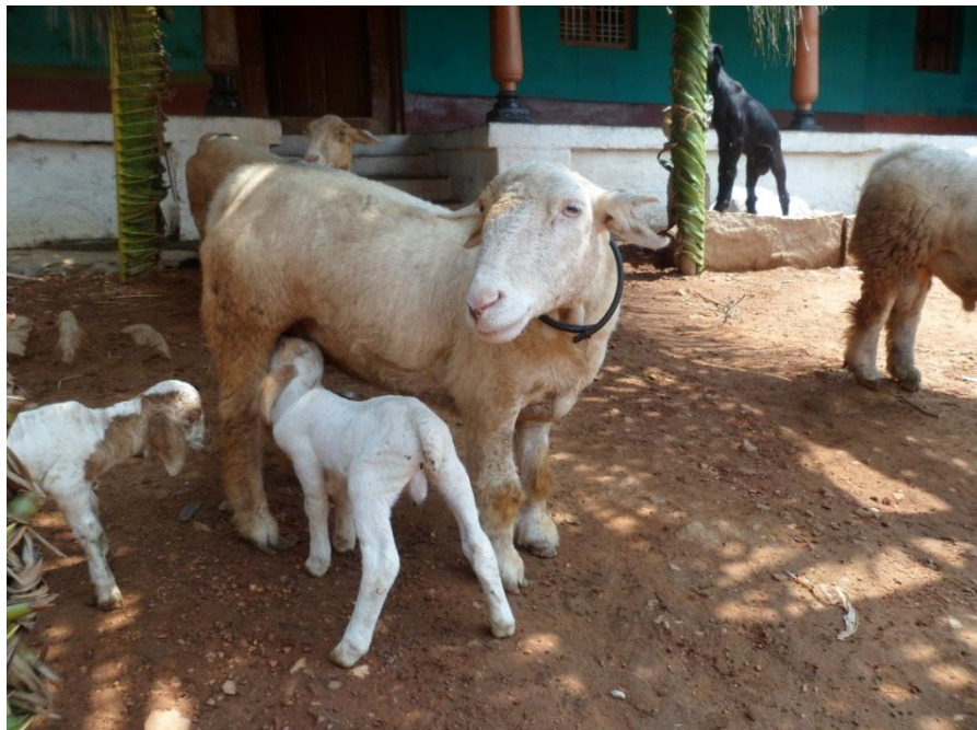
Fig . 7 Ewe with suckling lamb