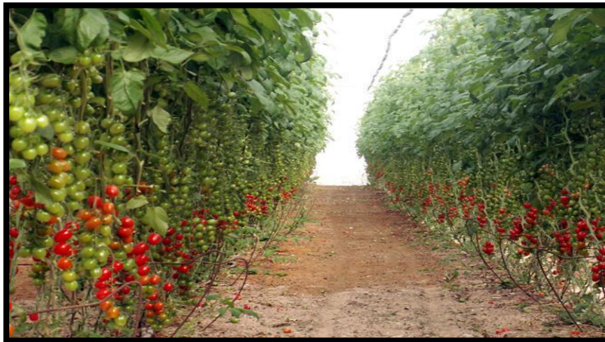
Tomato Under protected cultivation