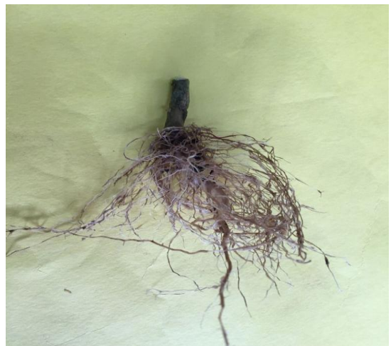
Roots of resistant rootstock at 30 days