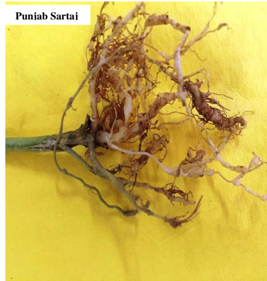
Roots of susceptible scion at 30 days