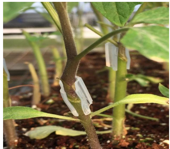
Fully healed plants ready for transplantation