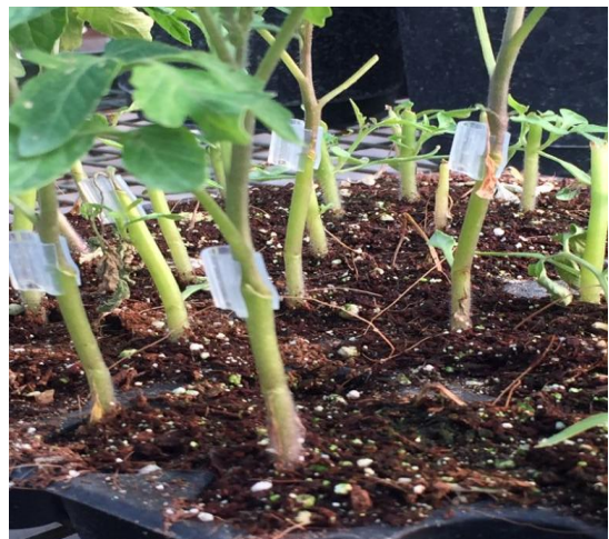
Grafted plants inside the chamber