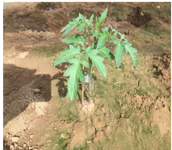
Healthy grafted plants at field