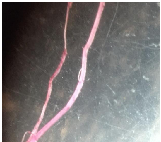
Infestation of nematode egg mass at 15 days on susceptible scion