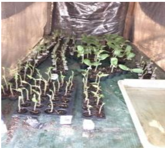
Healthy nursery prepared for grafting