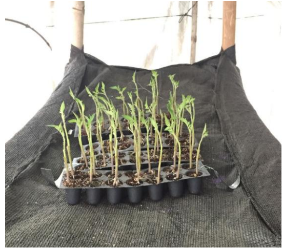
Plants ready for acclimatization