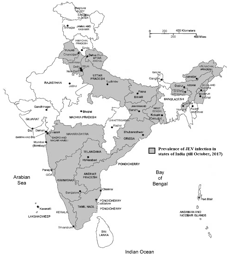
Figure 3 Occurrence of Japanese Encephalitis in India