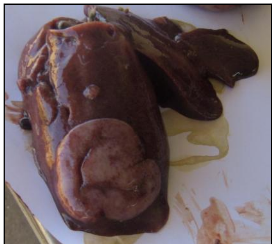
Fig 1. Liver showing enlarged coin like tumour and miliary greyish white nodules.