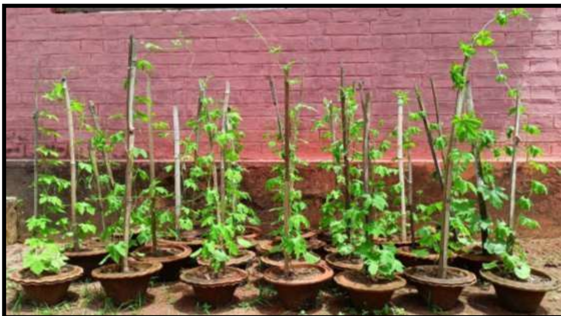
Fig 2. A view of bittergourd plants grown in replicated pots.