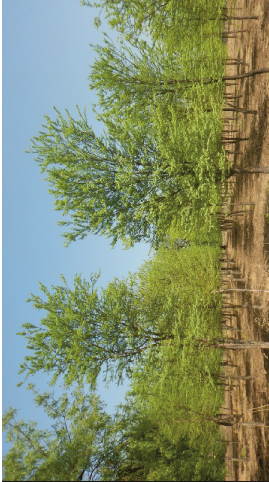
Plate 1 General View of experimental plot