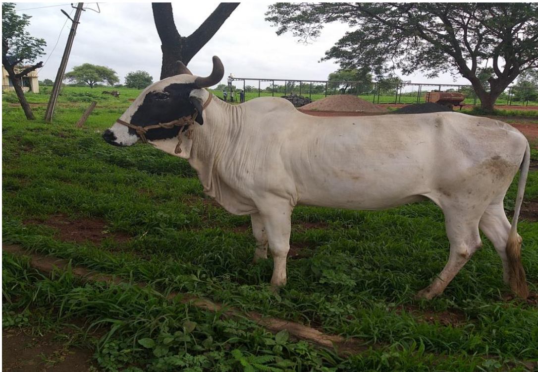
Plate 2: Deoni cow, Wannera type