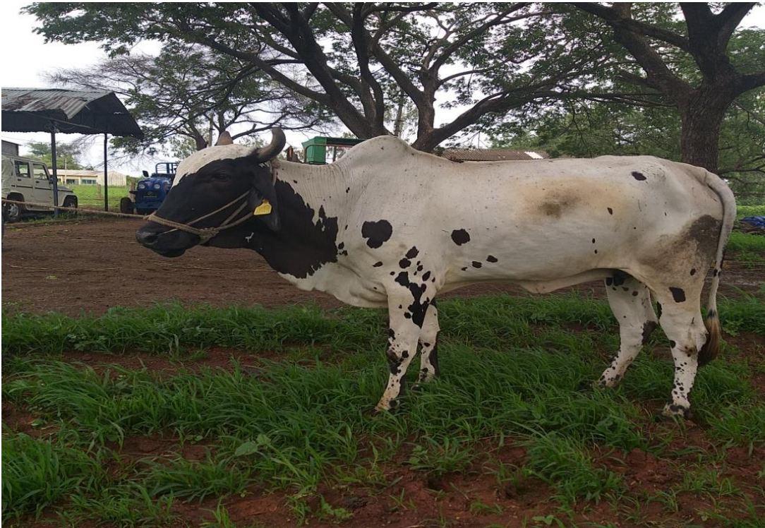
Plate 4: Deoni cow, Shevera type