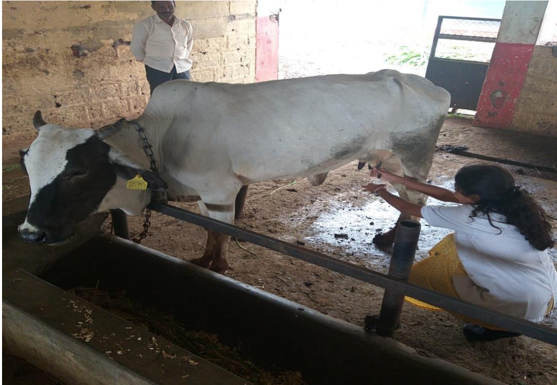
Plate 5: Collection of milk on test day to record LMY