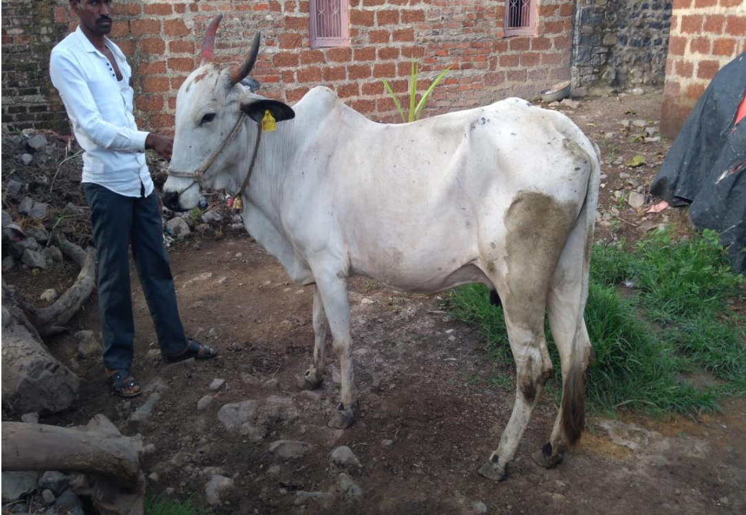
Plate 3: Deoni cow, Balankya type