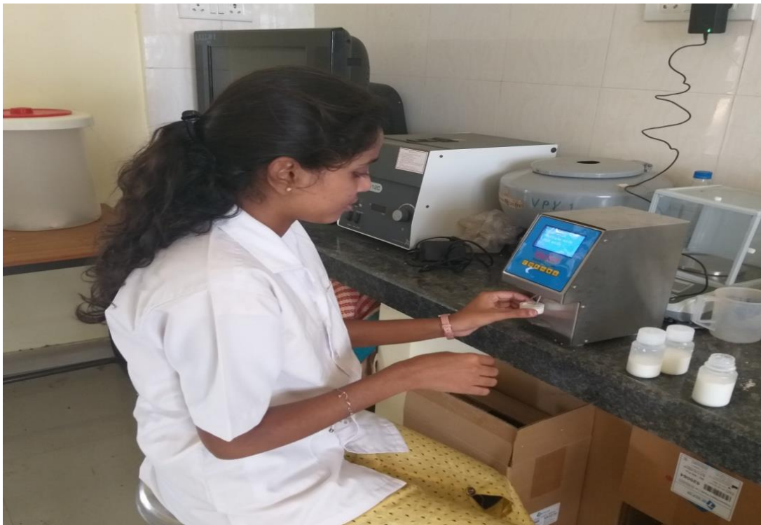
Plate 6: Milk analysis using Analyser (Vector®)