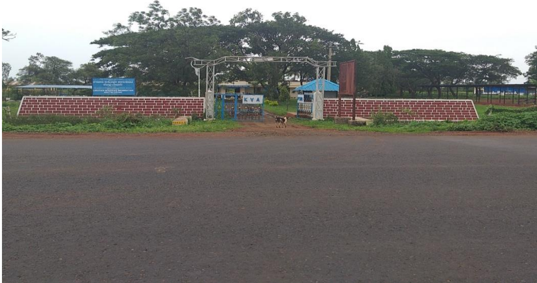
Plate 1: Livestock Research Information Centre (Deoni), Bidar