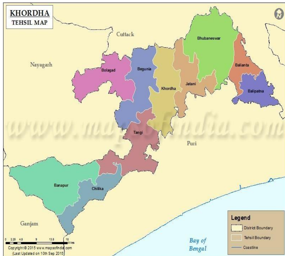
Fig. 3.1.2. Map of Khordha district