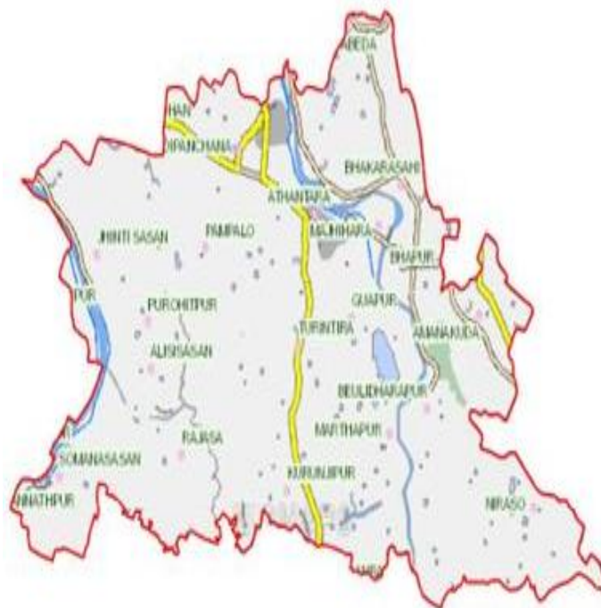
Fig. 3.1.4. Map of Balipatna