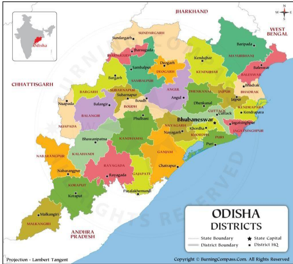
Fig. 3.1.1. Map of Odisha