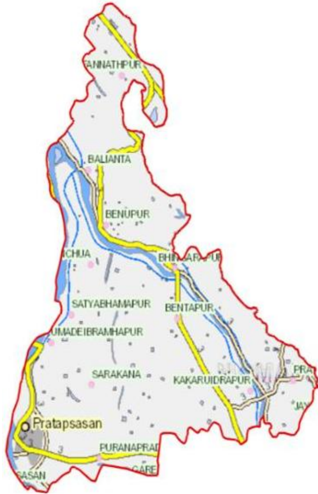
Fig. 3.1.3. Map of Balianta