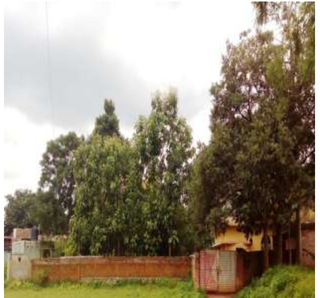
Plate 4.4- A View of Balalong Panchayat