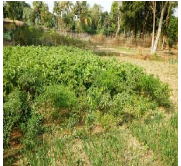
Plate 4.3- A view of Lalgutuwa Panchayat