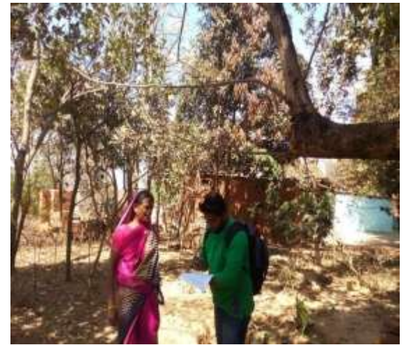
Plate- 4.2. A View of Saher Panchayat