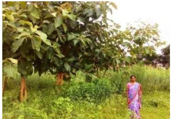
Plate- 4.1 A View of Edchero Panchayat