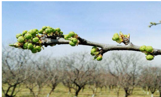
Tight cluster stage