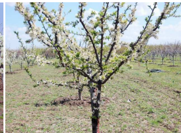
Petal fall stage