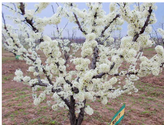
85% flowering stage (full bloom)