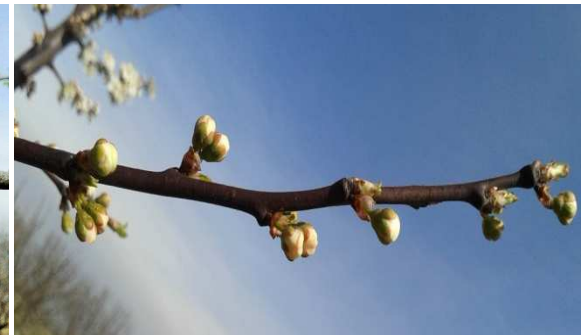
Open cluster stage