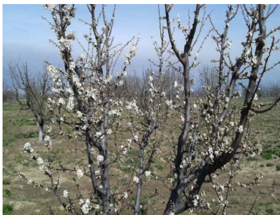
10% flowering stage