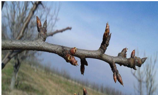
Bud swell stage