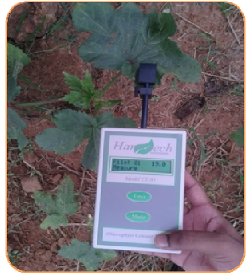
Fig. 4 Measuring fruit hardness by Penetrometer and chlorophyll index by Spad meter