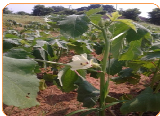
Fig. 3 Crop at flowering stage