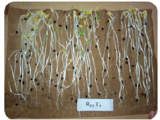
Fig. 6 Effect of foliar spray of growth regulator on different seedling parameter