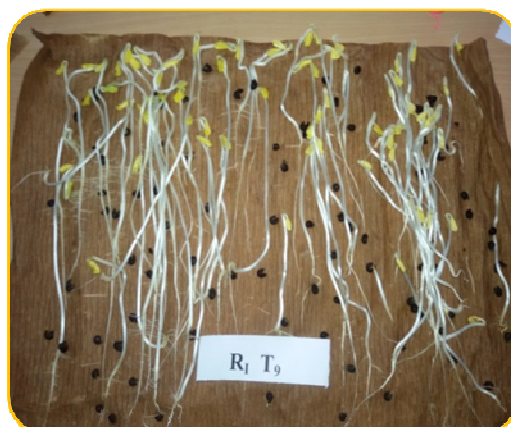
Fig. 7 Effect of seed treatment of growth regulator on different seedling parameter