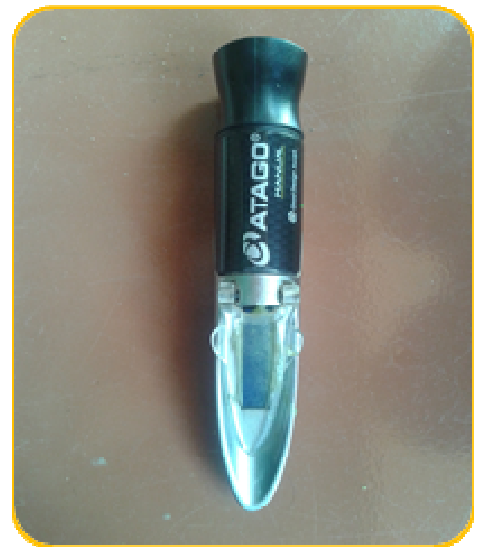
Fig. 5 Measuring TSS by Hand Refractometer