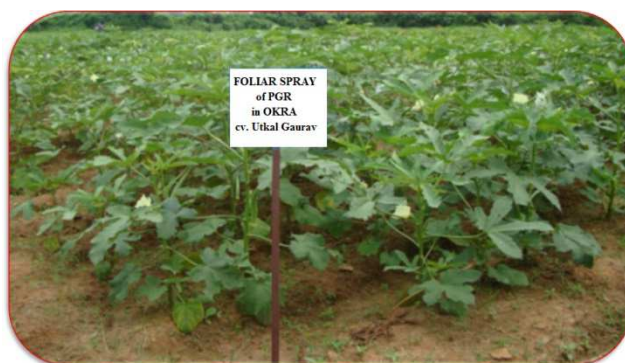
Fig. 2 Vegetative growth and early flowering