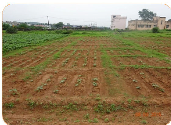
Fig. 1 An overall view of experimental field