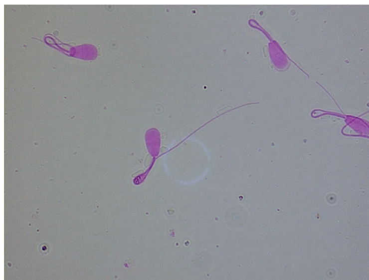
Figure 1. Dag-like defect of folding of tail of spermatozoa with retention and without retention of cytoplasmic droplet